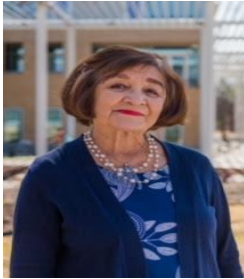
Estelle Lara Food Pantry at Metrocrest Services